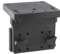
1025 | Right Angle Side Gunnel Mount