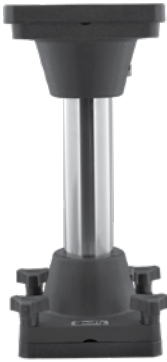
2612 | Downrigger Pedestal Mount 12" 6" (#2602)