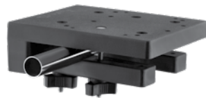
1027 | Rail Mount

For more information on these and other Scotty products, go to our website at www.scotty.com