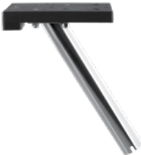
1028 | Gimbal Mount - 9" 12" (#1029)