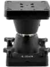
2606 | Downrigger Pedestal Mount 6"