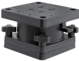
1026 | Pedestal Swivel Mount