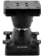
2606 | Downrigger Pedestal Mount 6"